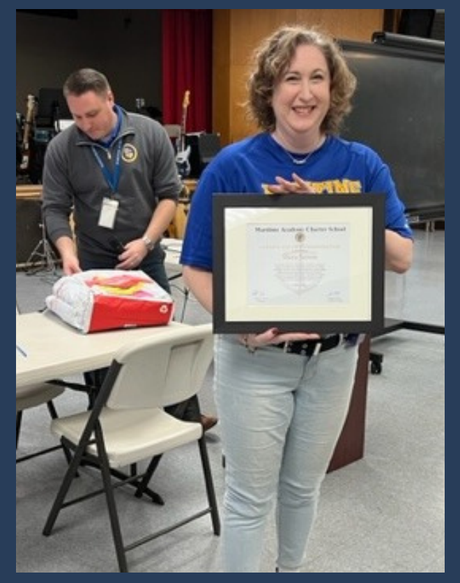
Bake Sale Fundraiser